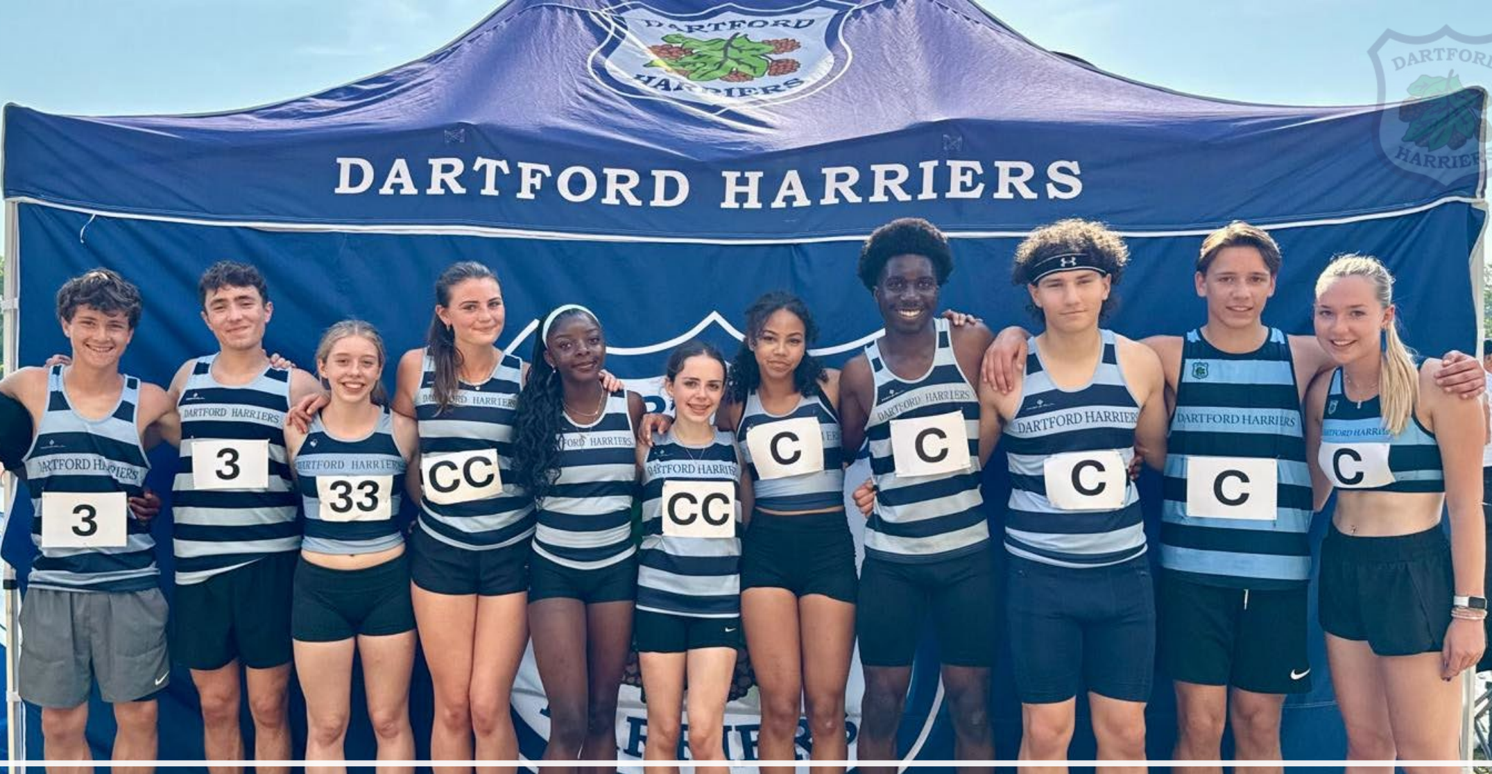
YDL Upper - Medway